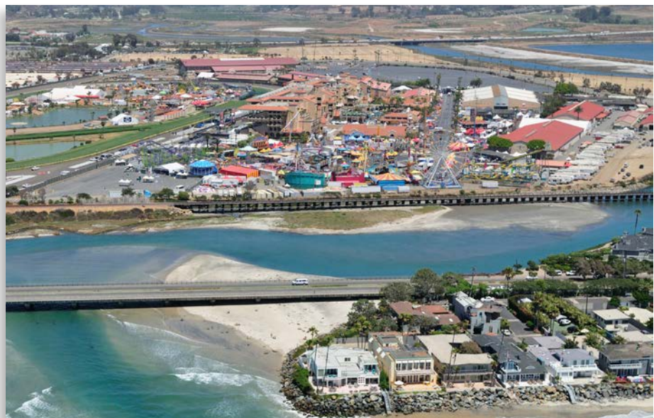
The San Dieguito Lagoon lies between Solana Beach and Del Mar.