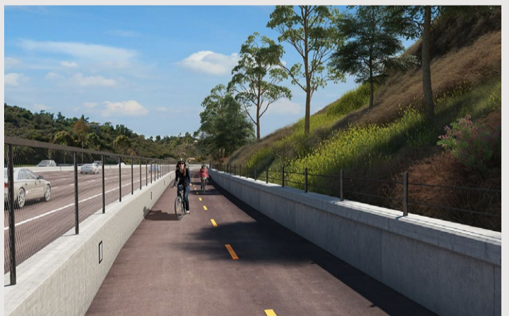
A visual simulation of the SR 15 Commuter Bikeway now under construction.

The SR 15 Commuter Bikeway is more than halfway to completion, as crews continue working on the path's foundation and the surrounding walls. The bikeway will provide a safe and direct route for people riding bikes to connect from the communities in the Mid-City area of the City of San Diego to the major retail, commercial, education, and entertainment destinations in the City's Mission Valley area. The bikeway will be separated from vehicle traffic by a concrete barrier and extend from Adams Avenue along a one-mile segment of northbound SR 15 to Camino Del Rio South. Construction crews will be working on the project primarily during the day in December with limited nighttime work. The project is anticipated to be completed in spring 2017.