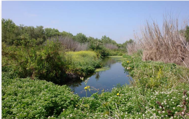
Morrison Property, San Luis Rey

Ownership: Caltrans Management: Caltrans Conservation Easement to SANDAG: No Native Habitat Restoration Proposed: Yes