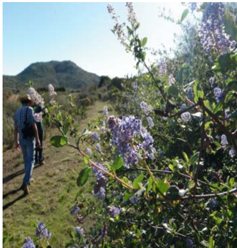
Hidden Valley, Jamul