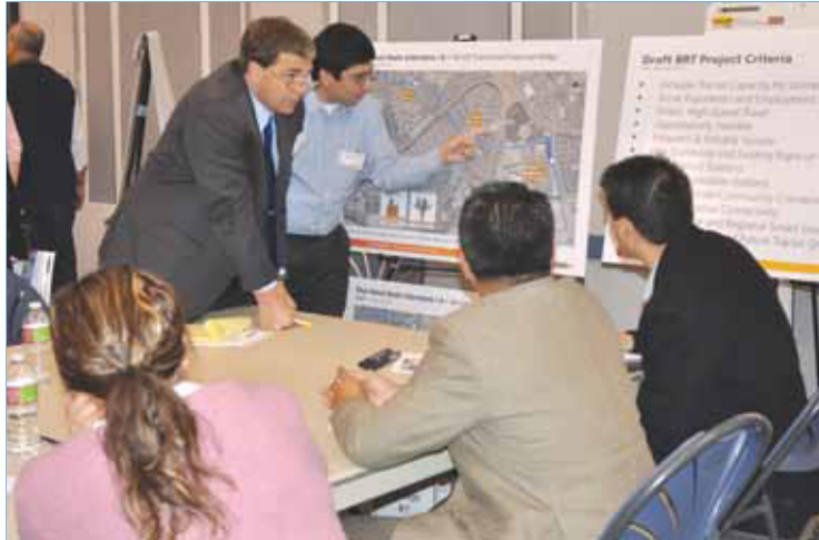
Team members answer questions about the South Bay BRT Project at a public meeting held on November 17, 2010.

presentation overview of the project and opportunities to learn more about the draft alternatives of the BRT at stations staffed by SANDAG team members. The criteria for selecting a final alternative was discussed in detail, and community members asked questions and provided their input on the project in both written and verbal form.