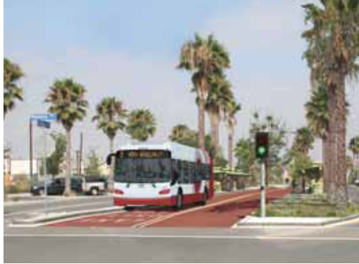
The transit-only guideway, pictured here, allows buses to avoid traffic and rapidly move passengers to their destinations.

The guideway also promotes energy conservation by limiting the number of times a bus needs to stop along the route through traffic signal improvements. Finally, stations along the guideway will be designed with level boarding curbs, providing quick passenger loading and unloading by avoiding the need for ramp deployment.