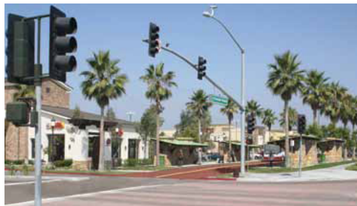
Depiction of the Otay Ranch Town Center Station planned for the west side of Eastlake Parkway at Kestrel Falls Road.

Planned for construction on the west side of Eastlake Parkway at Kestrel Falls Road, the South Bay BRT station at Otay Ranch Town Center will provide a number of amenities and conveniences to passengers.