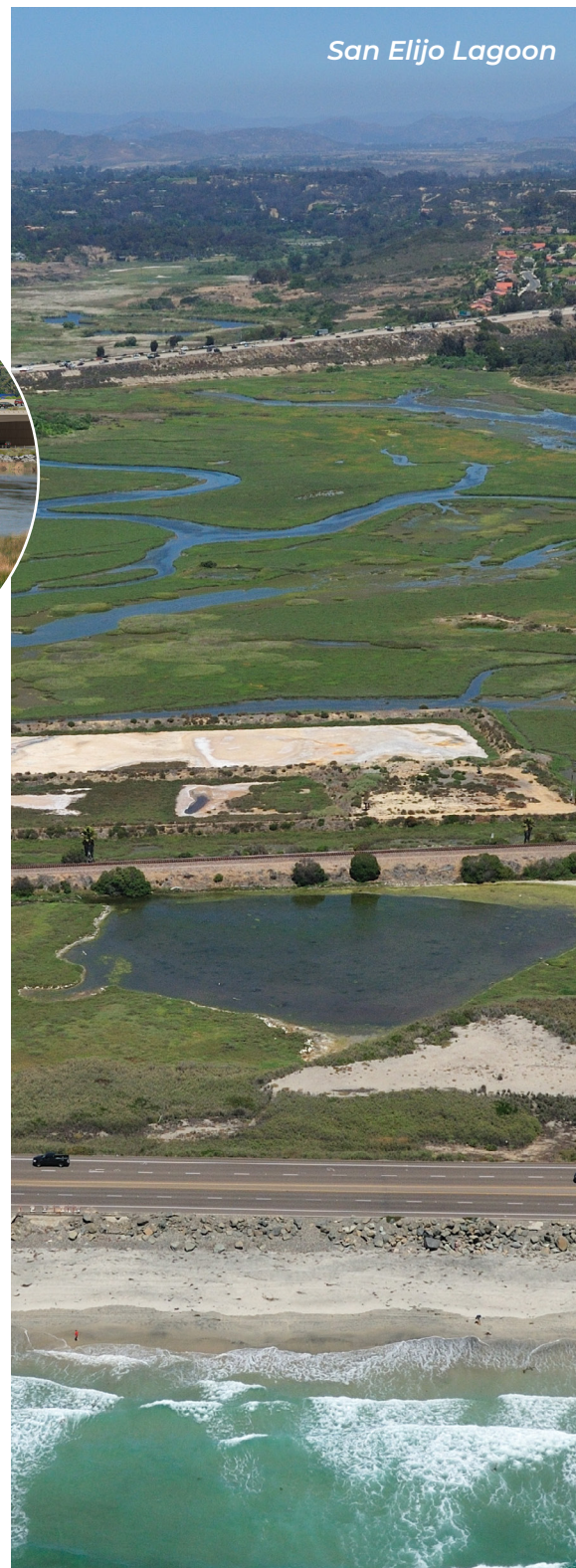
San Elijo Lagoon

To help reduce freeway noise for nearby residents, Caltrans will construct several sound walls on private property. In areas with views, transparent sound walls are offered to residents.