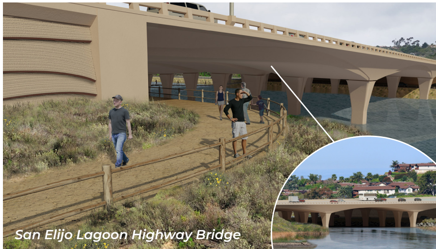
San Elijo Lagoon Highway Bridge