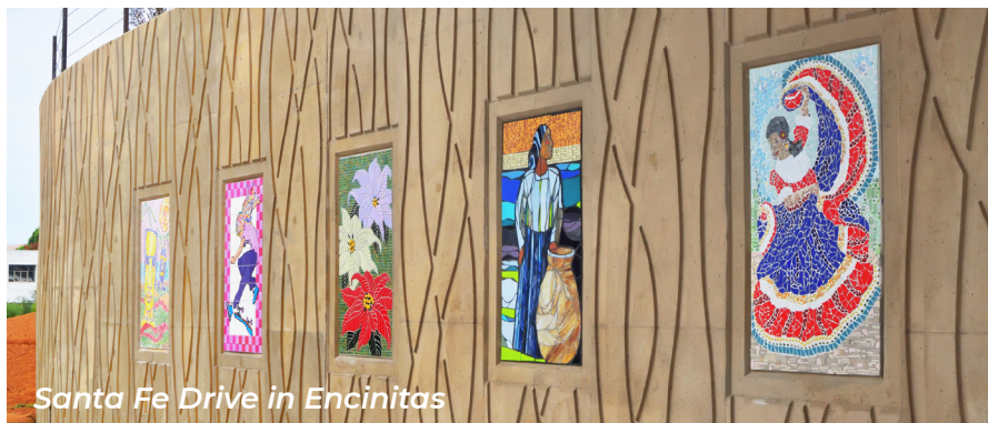
Santa Fe Drive in Encinitas

Separated bike and pedestrian paths were constructed at the I-5 interchanges at Santa Fe Drive and Encinitas Boulevard in Encinitas. These enhancements help improve east-west connectivity and safety for people walking and biking to nearby schools, activity centers, and coastal resources. Community artwork was incorporated in coordination with the city.