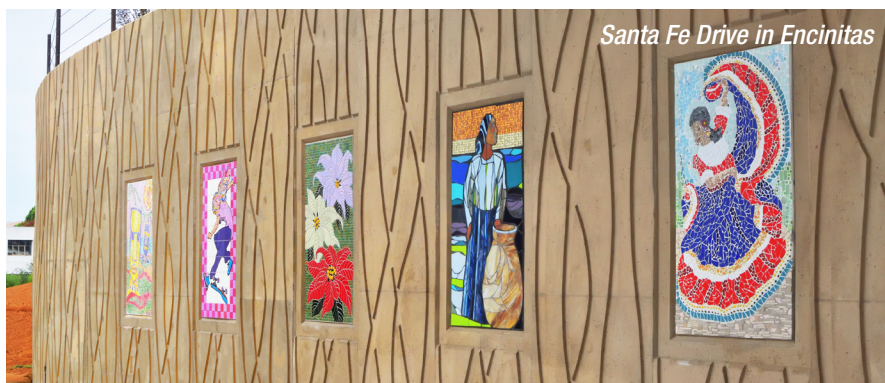
Santa Fe Drive in Encinitas

Separated bike and pedestrian paths were constructed at the I-5 interchanges at Santa Fe Drive and Encinitas Boulevard in Encinitas. These enhancements help improve east-west connectivity and safety for people walking and biking to nearby schools, activity centers, and coastal resources. Community artwork was incorporated in coordination with the city.