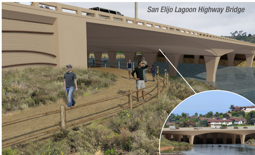
San Elijo Lagoon Highway Bridge