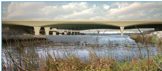
Once complete in 2022, the reconstructed bridge will improve lagoon tidal flow, accommodate new Carpool/HOV Lanes, and include a suspended bike/ped bridge.

Caltrans and SANDAG Build NCC highway construction crews will begin to demolish and dismantle the original Interstate 5 (I-5) highway bridge over the San Elijo Lagoon and Manchester Avenue in the City of Encinitas. This work is set to begin Sunday, March 1, and is estimated to take approximately four to six weeks to complete. Overnight demolition and dismantlement will take place on Sundays through Thursdays from 9 p.m. to 5 a.m.