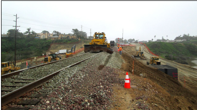
Crews shape and distribute the rock ballast on the track and shoulders of the rail line.

In northern San Diego, work will be underway on two of the four rail bridge replacements. Crews will be working on the foundation of the northernmost bridge and completing work on the bridge structure at the southernmost bridge. The project is expected to be complete mid-2017.