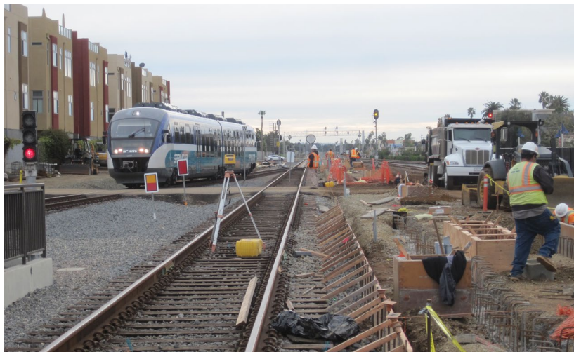
Crews work on the new platform at Oceanside Transit Center

This weekend, crews will be working on Saturday, February 11 from 12:00 a.m. to 2:00 p.m. on the Oceanside Transit Center Platform Improvement Project . Anticipated work includes installing a rail turnout and replacing wooden rail ties. This work will take place in the area between Michigan Avenue and Wisconsin Avenue. Construction noise and lights will be associated with this work. Crews will minimize impacts to nearby residents and businesses as much as possible.