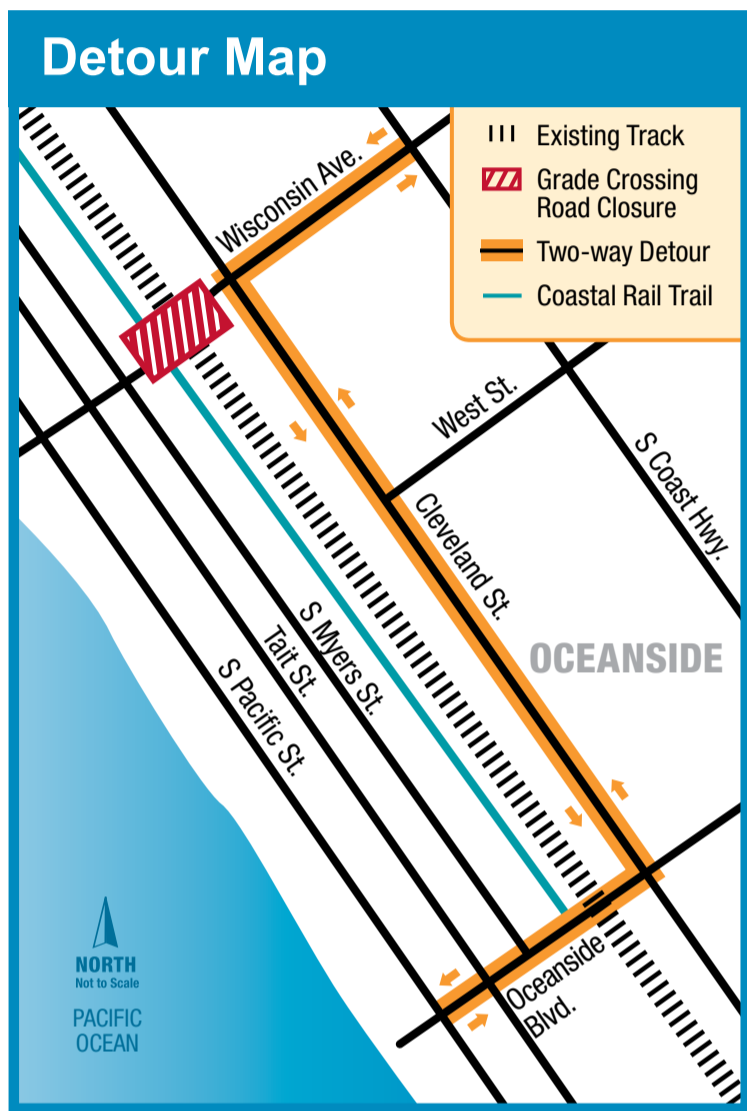
Drivers, bikers, and pedestrians are encouraged to follow the detour. Please note the Coastal Rail Trail will remain open during construction.

Crews will be closing the Wisconsin Avenue grade crossing from Tuesday, September 20 to Friday, September 23 , in order to install electrical fixtures, irrigation lines, and other utilities. Public parking may be limited on the west side of the crossing. Detour signage will be in place to ensure that motorists and people walking and biking are able to cross the tracks using Oceanside Boulevard.