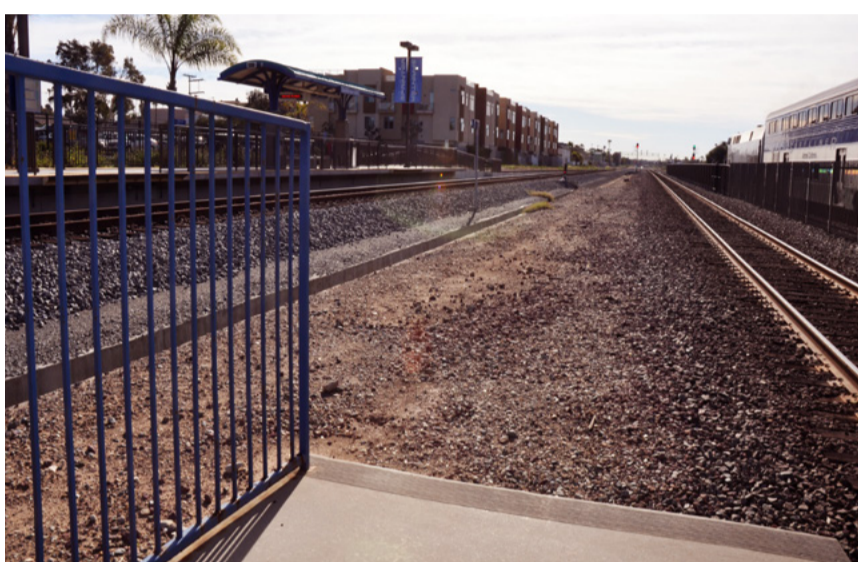
Crews will be working to remove a small section of the platform to make way for future improvements.

Daytime work on Tuesday, June 28, could include some noise, as crews remove the southern end of the easternmost platform. Concrete removal work will occur between the hours of 7 a.m. and 4 p.m. Service interruptions are not anticipated, and transit riders should continue to use their regular platforms to board. Additional daytime work in the project area will include preparing the foundations for the new light poles and installing a new drainage system and temporary fencing.