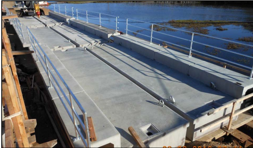
Crews prepare the precast concrete bridge girders required to build the first half of the new northernmost bridge, which is scheduled for installation this weekend.

Construction crews are working to replace four wooden trestle railway bridges as part of the Los Peñasquitos Lagoon Bridges Replacement Project . During the planned AWWs, construction crews will demolish sections of the old, northernmost railroad bridge over the Los Peñasquitos Lagoon and place steel support beams to frame and support the new span.