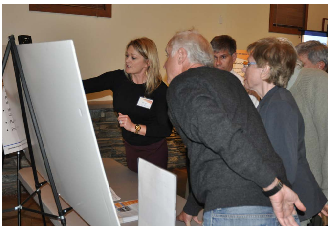
Attendees asked questions directly to the project team at the public information open house.

The project team shared with open house attendees the details of the preferred alternative, an eastern track alignment with side-loading platforms, that will be carried forward into the next phase of design. This alignment is closest to the fairgrounds and maximizes the area for potential lagoon expansion and enhancement. Additionally, it shifts the tracks furthest from the nearby residences south of the San Dieguito River. View the details of the track alignment and a photo illustration of the preferred track placement near the bridge.