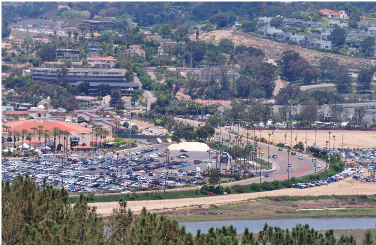
The fairgrounds is studying the feasibility of future cessation of an additional 1,500 spaces in the East Overflow Lot.

Last year, demand exceeded capacity on both Amtrak and North County Transit District (NCTD) COASTER trains during fairground special events. On opening day of the horse races last year, daily ridership doubled on the COASTER leaving standing room only. Amtrak and NCTD's COASTER regularly added more train cars to serve the high demand during special events. The attractiveness of a direct transit option is underscored as parking at the fairgrounds continues to decrease in order to preserve lagoon wetlands. The fairgrounds will lose 1,250 parking spots in the fall of 2015.