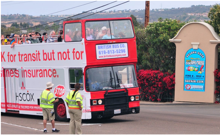
Train passengers must now board a shuttle bus at Solana Beach Train Station to complete their trip to the fairgrounds.

As one of the main event centers in San Diego County, the Del Mar Fairgrounds welcomes millions of visitors each year from all over Southern California and other areas. Today, people traveling by passenger trains arrive at the Solana Beach Train Station, then must transfer to a shuttle bus that drives them the final two miles to complete their trip to the fairgrounds. To make rail travel an increasingly attractive option for future fairgrounds attendees, SANDAG is planning a special events platform adjacent to the fairgrounds.