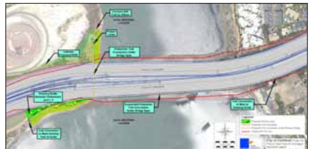
Plan: Proposed suspended pedestrian bridge and new trail under I-5 at Agua Hedionda Lagoon

This project proposes a suspended pedestrian bridge under I-5 running north-south that would connect to a loop trail around Agua Hedionda Lagoon and to trails west of the highway. Also proposed is a trail on the south side of the lagoon opening that would connect the east and west sides of the lagoon under I-5. An added benefit of this enhancement is an improved connection from the east side of I-5 to existing west side routes that lead to the coastline.