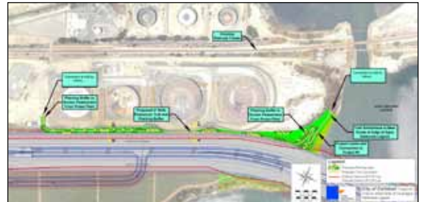
Plan: Proposed new trail on west side of I-5 at the Agua Hedionda Lagoon

This project proposes a new section of trail running adjacent to the west side of I-5 that would connect to the Coastal Rail Trail and a future trail at Agua Hedionda Lagoon. An added benefit of this enhancement would be an improved trail connection from I-5 to existing west side routes that lead to the coastline.