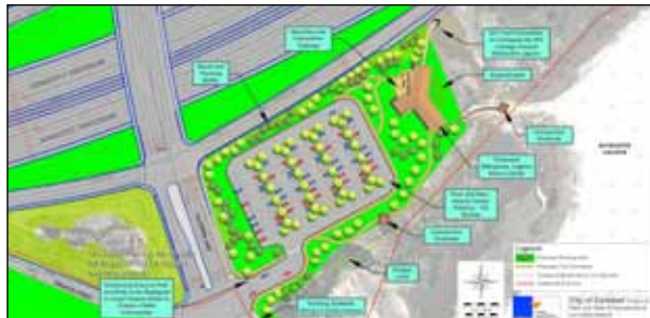
Plan: Proposed Park & Ride enhancement and new nature center at the Batiquitos Lagoon

This project proposes landscape and lighting improvements to an existing Park & Ride that would not only service carpooling, but would also provide parking for a new nature center and a staging area for pedestrian and bike trails at Batiquitos Lagoon.