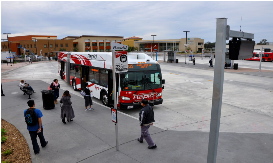
Two Rapid routes and five local bus routes serve the transit station.

In Summer 2012, construction began to improve travel choices and transit services in the Mira Mesa community. The project opened in October 2014 and includes the new Miramar College Transit Station and the Mira Mesa Direct Access Ramp (DAR), which connects Hillery Drive in Mira Mesa to the I-15 Express Lanes.