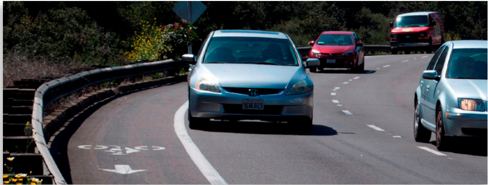
Texas Street - Looking south at northbound Texas Street near Camino del Rio South.