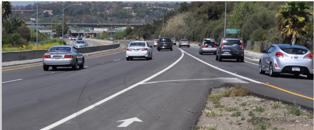
Fairmount Avenue - Looking north on Fairmount Avenue where the westbound Montezuma Road ramp merges onto northbound Fairmount Avenue, showing high-speed traffic conflicts as vehicles travel through the path of bike riders.