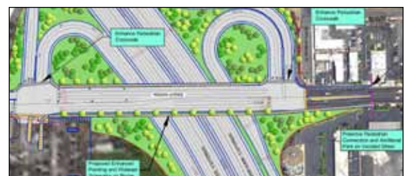
Plan: Enhanced Pedestrian Overpass Connection at Mission Avenue

9 Regional Gateway Feature at Harbor Drive This project proposes a regional gateway feature along I-5 that would welcome visitors to the County of San Diego.