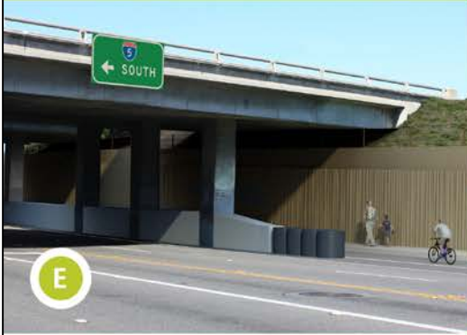
Encinitas Blvd./Santa Fe Dr. Bike/Ped Enhancements