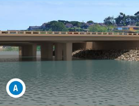
Batiquitos Lagoon Double Track (Includes Lagoon Bridge Replacement)