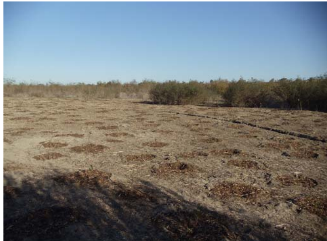
Tijuana Wetlands, Tijuana River Valley

Ownership: County of San Diego Management: County of San Diego Conservation Easement to SANDAG: Yes Native Habitat Restoration Proposed: Yes