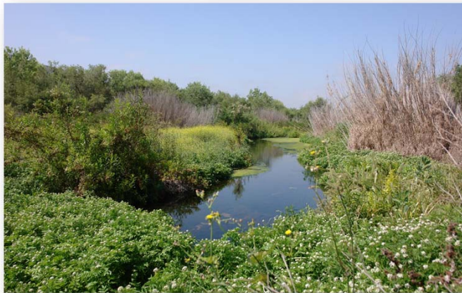
Morrison Property, San Luis Rey

Ownership: Caltrans Management: Caltrans Conservation Easement to SANDAG: No Native Habitat Restoration Proposed: Yes