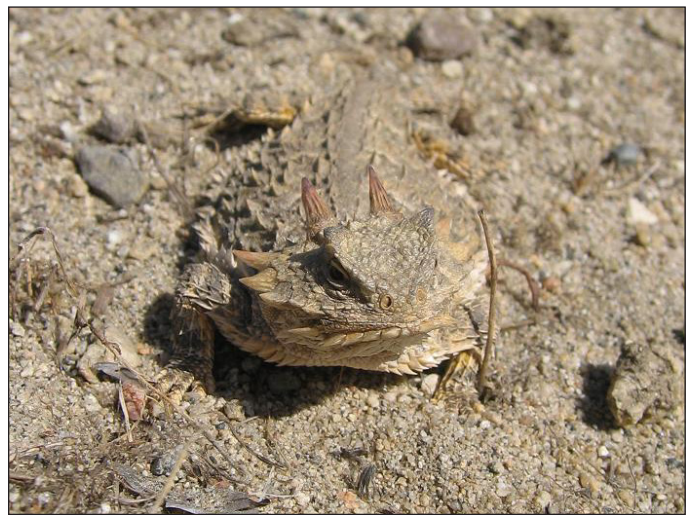
Animal crossings & directional fencing facilitate the movement of Coast Horned Lizards & other wildlife.