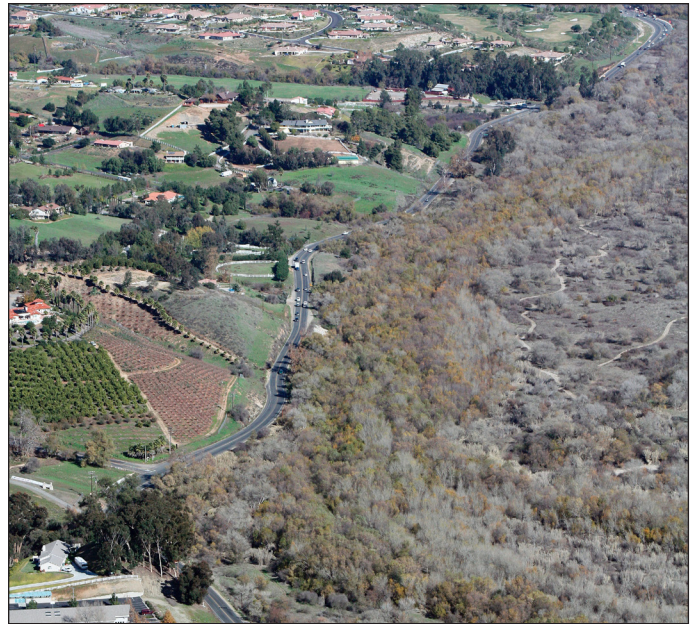
Minimizing environmental impacts is an important component of the decision-making process.

In accordance with the National Environmental Policy Act and the California Environmental Quality Act, a Draft Environmental Impact Report/Environmental Impact Statement (EIR/EIS) was prepared. It compared and analyzed two build alternatives, the Existing Alignment and the Southern Alignment, against the No Build alternative to determine how each would impact the environment and community. The Existing Alignment would widen and realign the current highway and the Southern Alignment would create a new highway south of the San Luis Rey River. The Draft EIR/EIS was circulated for public review and comment in September 2010.