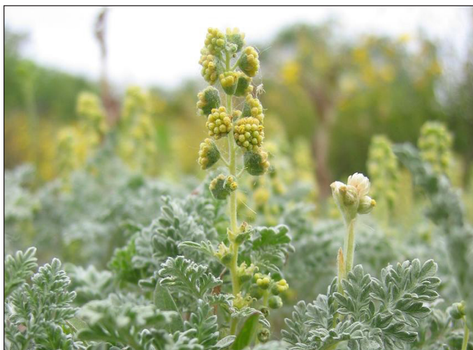
Environmental mitigation efforts protect, preserve & restore native plants like San Diego Ambrosia.