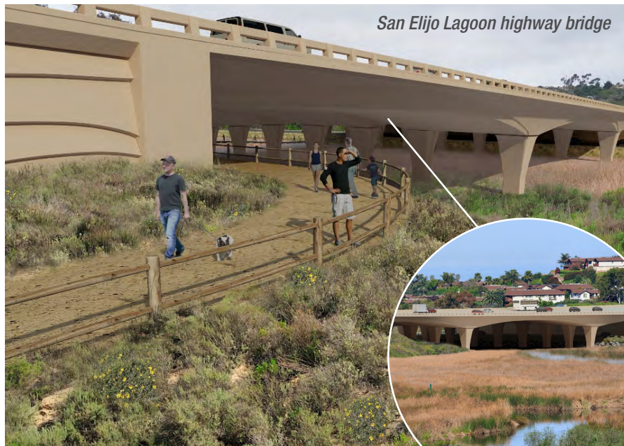
San Elijo Lagoon highway bridge