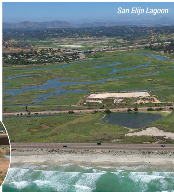
San Elijo Lagoon

The San Elijo Lagoon highway bridge will be replaced and lengthened to help improve tidal flow in the lagoon. The wider bridge will accommodate an additional carpool lane in each direction. In addition, a suspended bike and pedestrian bridge will be built underneath the San Elijo Lagoon highway bridge to further increase north-south and east-west connectivity, and create more travel options. A 10-mile North Coast Bike Trail bike trail will be constructed to expand the regional bike and pedestrian network.