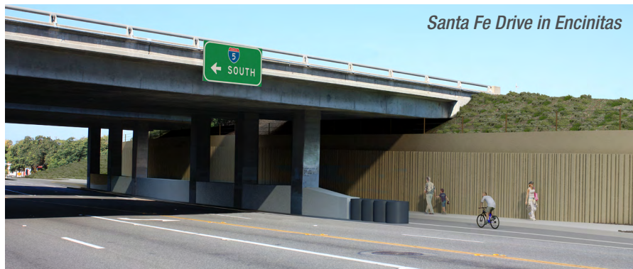
Santa Fe Drive in Encinitas

Build NCC includes local bike/pedestrian path improvements in Encinitas and Carlsbad. The interchanges at Encinitas Boulevard and Santa Fe Drive will be upgraded with new bike and pedestrian paths.