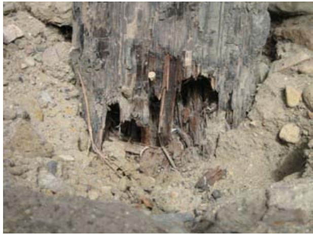
Close-up of pile deterioration