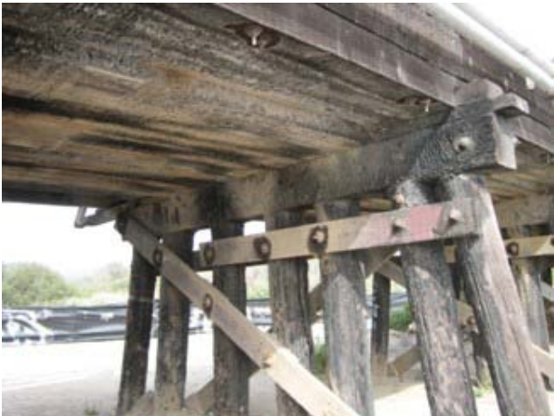
Charring of bridge timbers from man-made fires