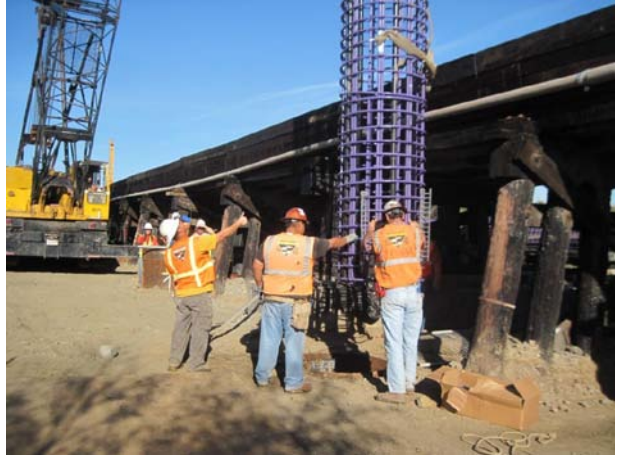
Crews set steel reinforcements for the concrete pile foundations