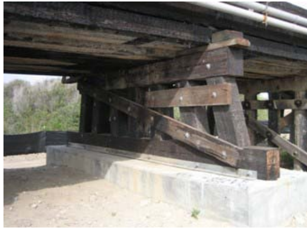
Interim "frame bent" repair