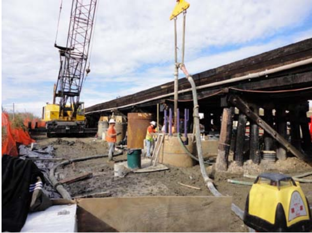
Construction is underway to replace San Mateo Creek Bridge