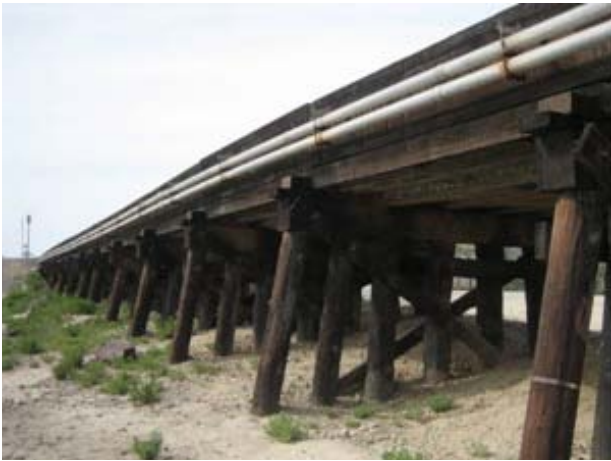
San Mateo Creek (Trestles) bridge, north approach