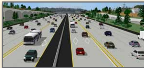
Once completed, the I-805 South Project will add two Express Lanes from East Palomar Street in Chula Vista to the I-805/I-15 interchange