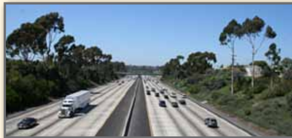
Existing condition of the I-805 South freeway

The second phase of the I-805 South Project will further increase transportation choices by expanding the HOV lanes into Express Lanes for a total of four lanes, two in each direction. The Express Lanes will serve the planned South Bay Bus Rapid Transit (BRT) project, carpools, vanpools, buses, motorcycles, permitted clean air vehicles, and solo drivers using the FasTrak® electronic tolling system. Phase 2 also includes the addition of in-line transit stations built in the freeway center median and freeway-to-freeway direct connectors. Work on the second phase of the project is scheduled to begin in 2015 and be completed in 2020.