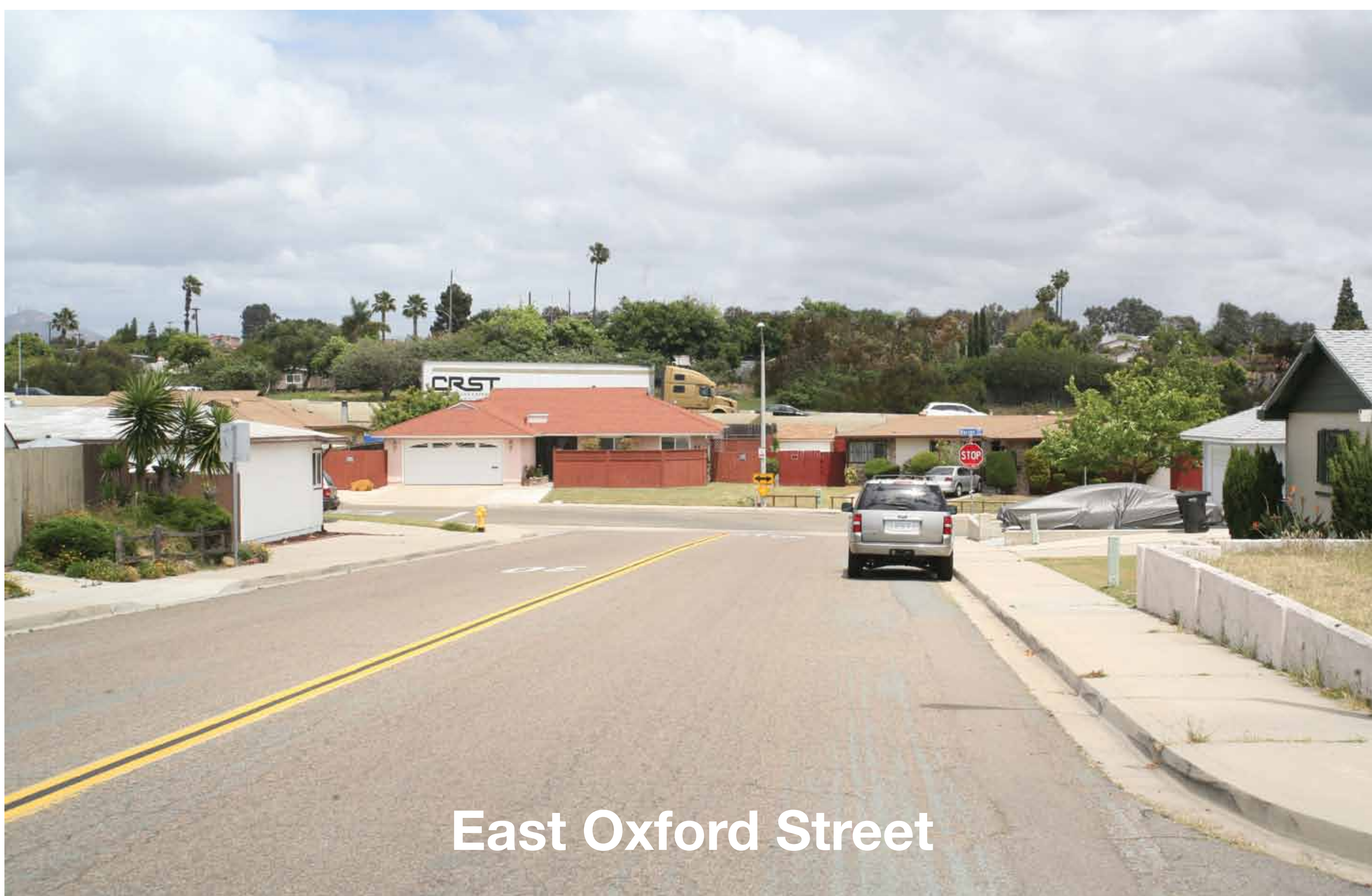
Proposed View with Retaining Wall/Barrier