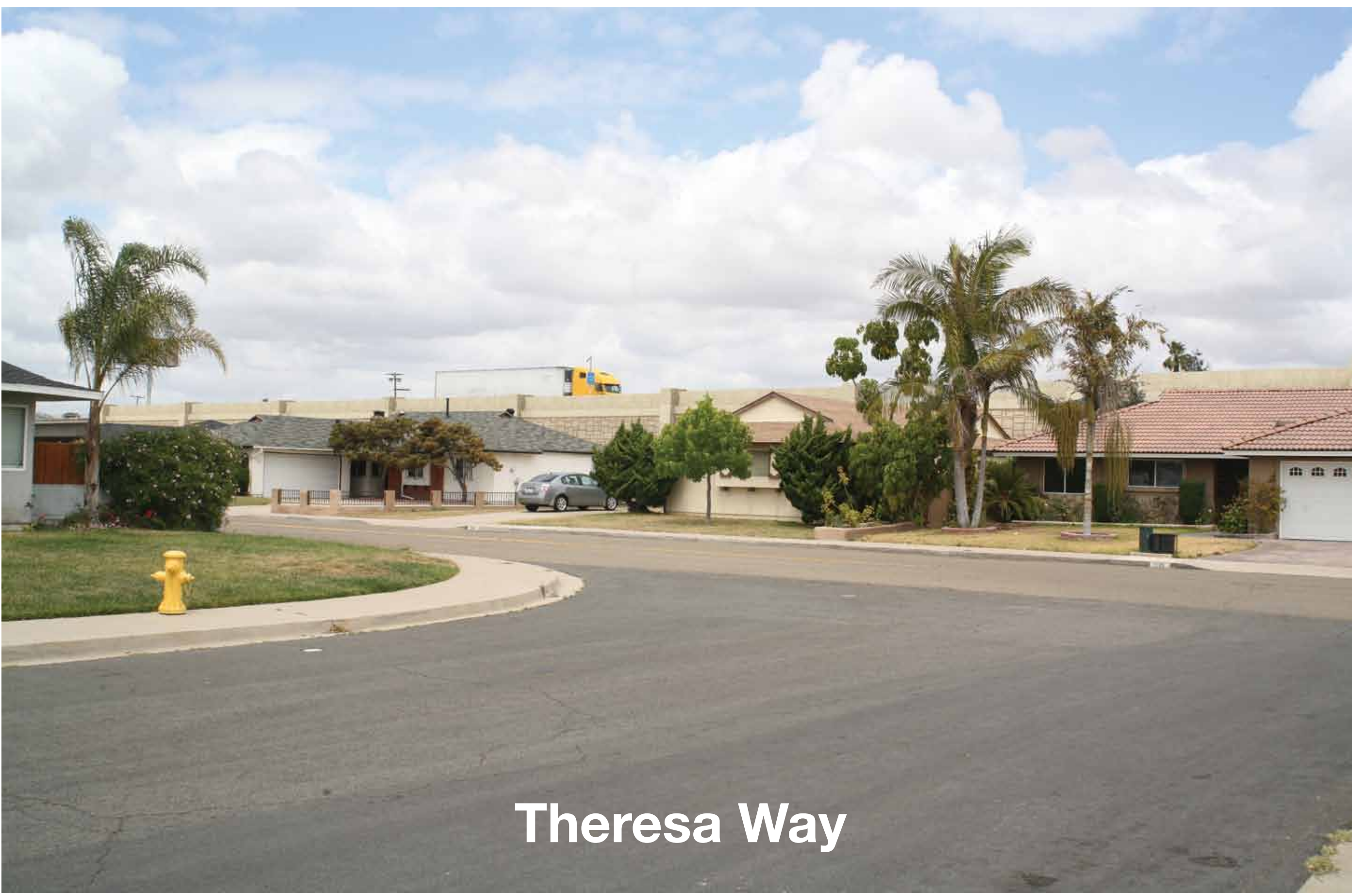
Proposed View with Retaining Wall/Barrier