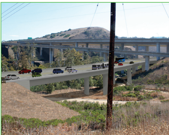
Looking southwest toward the Carroll Canyon Road Extension under I-805.

We appreciate your continued patience as we forge ahead on the I-805 HOV/Carroll Canyon Road Extension Project, an effort made in partnership with the federal government, City of San Diego and area businesses. Ultimately, this project will help relieve congestion, add balance to the interchange and create additional access for businesses to the freeway.