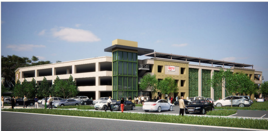
Photo simulation of the new parking structure.

Operated by the Metropolitan Transit System (MTS), this high-frequency Express Bus service will connect residential areas with major employment centers, including Downtown San Diego, UCSD, and Escondido. Services will run more often, offering increased reliability, and customer convenience. Direct Access Ramps (DARs) will connect the new, upgraded transit stations to the I-15 Express Lanes.