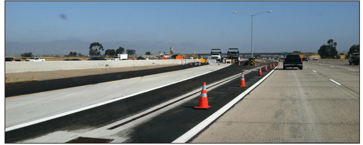
New entrances to the Express Lanes, like this one at Miramar Way, will open on June 27th.

That particular entrance will be important for drivers coming from Carmel Mountain Road and Camino Del Norte. Temporarily, they'll have to use it. The entrance ramp they've taken, on the