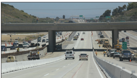
Work near Poway Road bridge is expected to be finished soon.

We're excited about the progress we're making on the I-15 Express Lanes project. While work continues, much of it is being completed ahead of schedule. In the South Segment, the Carroll Canyon