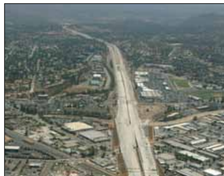
The I-15 North Segment is expected to be completed this winter.

makes it easy for Express Lane users to access the Express Lanes directly from Hale Avenue without merging from the main lanes.