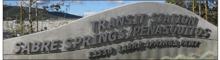
The entrance sign to the Sabre Springs Transit Station; 500 new parking spaces will be constructed here beginning in fall 2011.

located at Rancho Carmel Drive and Ted Williams Parkway or at the Carmel Mountain Plaza lot immediately adjacent to Reading Cinema 12. Routes 820 and 860 will be enhanced to provide similar levels of service that are currently offered at the Sabre Springs Transit Station. Please contact the I-15 Public Information Office at 858-668-3368 with any questions.