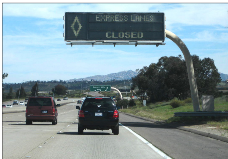
The usual entrance into the I-15 Express Lanes from northbound SR 163.

A series of major closures will begin this spring in the I-15 Express Lanes. These closures will require your patience and preparation. The good news is that soon after we complete the closures, the South Segment of the I-15 Express Lanes Project will be close to completion.