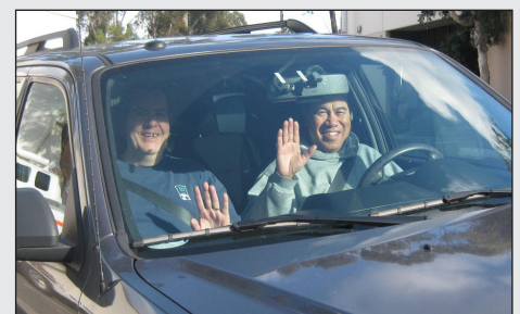
You need two or more people in your car to drive free in the I-15 Express Lanes.

Want to learn how to join a carpool or vanpool? Visit icommutesd.com to learn more about incentives and RideMatcher, a rideshare matching service.