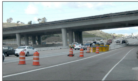
Poway Road/Rancho Peñasquitos Boulevard bridge.

We anticipate a busy year to keep us on track to complete the I-15 Express Lanes Project by late 2011/early 2012.