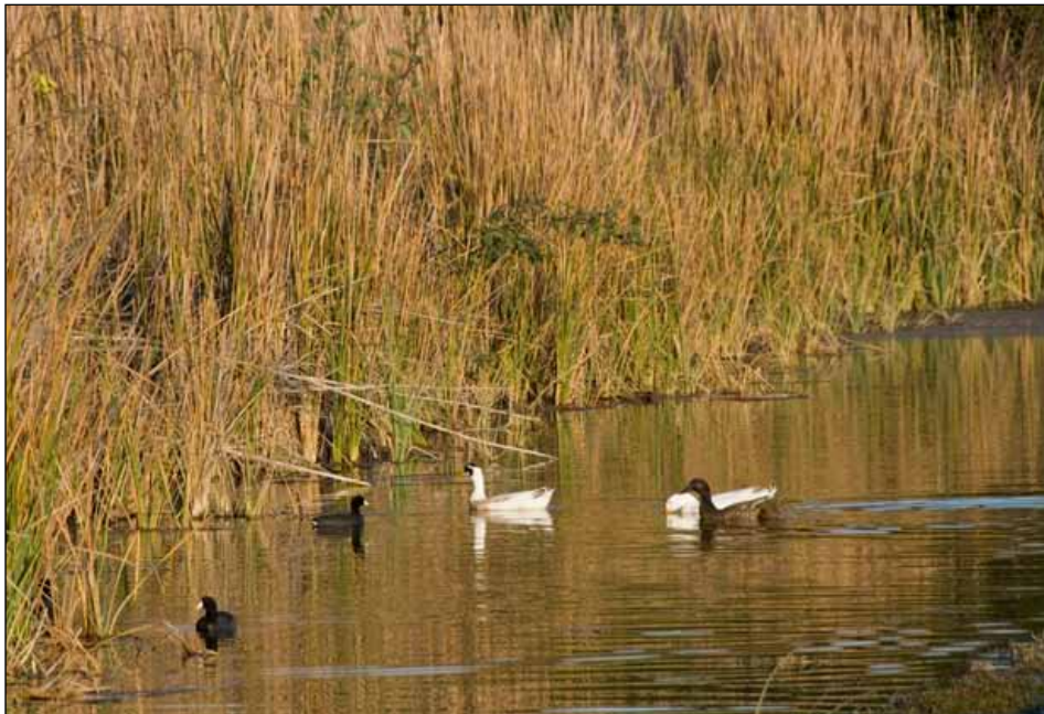
The corridor's lagoons support valuable and sensitive habitat.