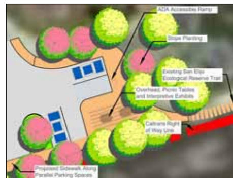
Plan view: Proposed trailhead at Solana Hills Drive in Solana Beach.

Caltrans looks forward to this opportunity to continue working with the I-5 NCC's communities to implement the proposed enhancement projects. Each of these projects are dependent on creating formal agreements with each city and Caltrans.