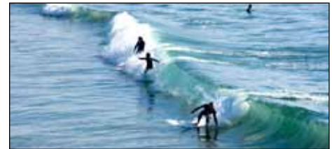
Oceanside City Beach