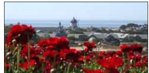
Carlsbad Flower Fields