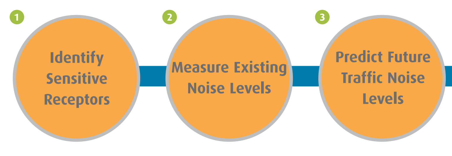
Figure 2: Noise Abatement Process

A traffic noise impact is predicted to occur when the forecasted traffic noise exceeds the existing noise by 12 decibels or more. Additionally a noise impact is predicted to occur when the forecasted traffic noise is within 1 decibel of or exceeds the Federal Noise Abatement Criteria (See Figure 1).