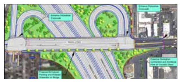
Plan: Enhanced Pedestrian Overpass Connection at Mission Avenue

This project proposes a regional gateway feature along I-5 that would welcome visitors to the County of San Diego.