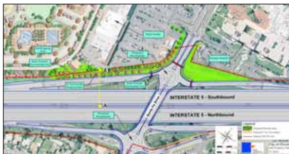
Hall Property Park pedestrian trail connecting to Santa Fe Drive.

This project proposes a new pedestrian route between Hall Property Park and Santa Fe Drive.