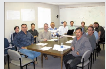
Some of the construction and design team members of the Express Lanes project.

If you have any questions or concerns regarding the project, please call us at 858-668-3368 or visit www.KeepSanDiegoMoving.com to find newsletters, construction advisories, news releases, and nightly closures posted daily.