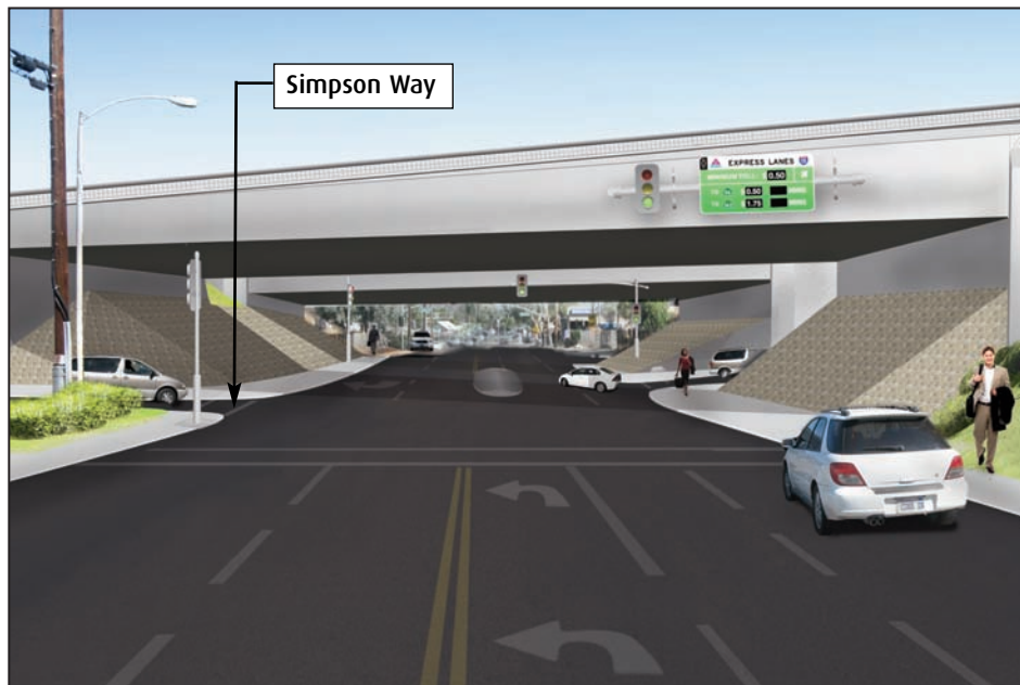
Artist Rendition: Looking east at the Hale Avenue underpass and future Direct Access Ramp.