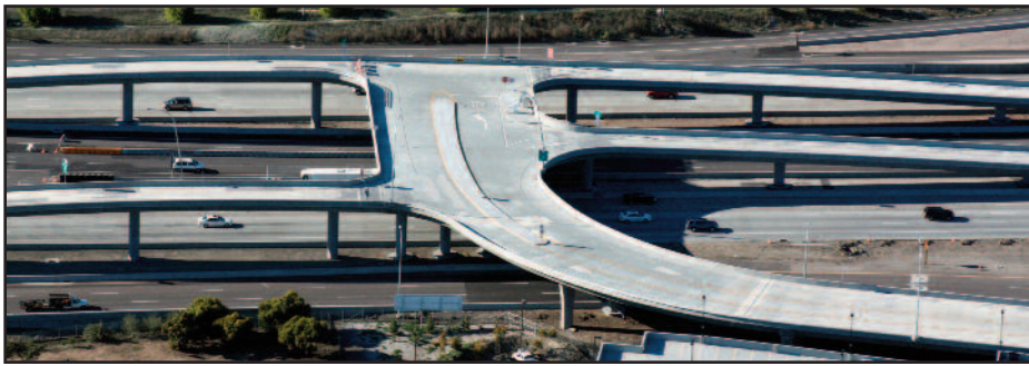
Direct Access Ramp at Sabre Springs/Peñasquitos Transit Station

The Interstate 15 (I-15) Express Lanes will provide a four lane, 20 mile express lane facility in the median of the I-15 stretching from State Route 163 (SR-163) north to State Route 78 (SR-78). The I-15 Express Lanes is the first adaptable, high-tech transportation facility configured to meet the diverse needs of local travelers, commuters and commerce in the San Diego region. The new express lanes will be available for free to transit, carpools, vanpools, motorcycles, and permitted clean air vehicles. For a fee, single occupant vehicles will also be able to travel on the Express Lanes using the FasTrak® electronic tolling system. Once the I-15 Express Lanes are completed in 2012, a new Bus Rapid Transit (BRT) System will provide high frequency transit service that is the first of its kind in San Diego.